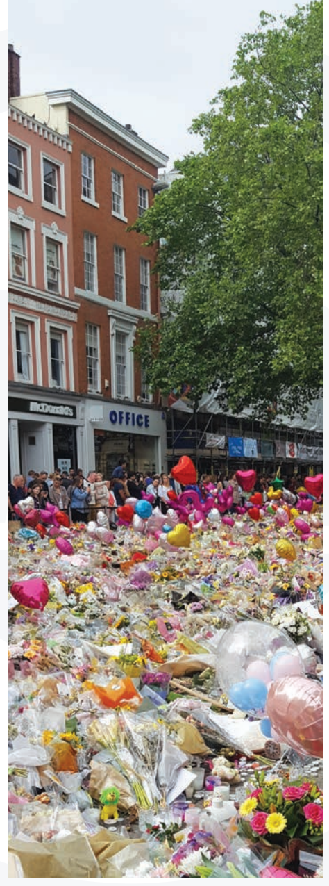
St Ann's Square